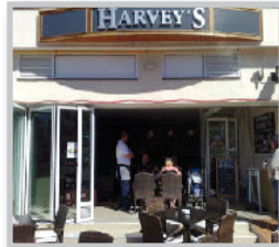
Stores & Restaurants